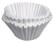
FILTERS, GOURMET 500 500/1 50/CL Product #: 20138.1000