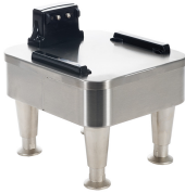
1SH STAND, 120V INF SERIES Product #: 27825.0200