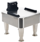
1SH STAND, 120V INF SERIES