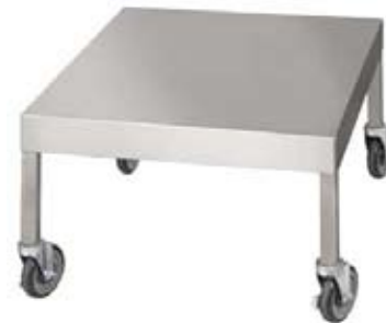
Mobile Stand STSM (92-1021)

JOB NAME: _____ ITEM NO.: _____ NO. REQUIRED: _____