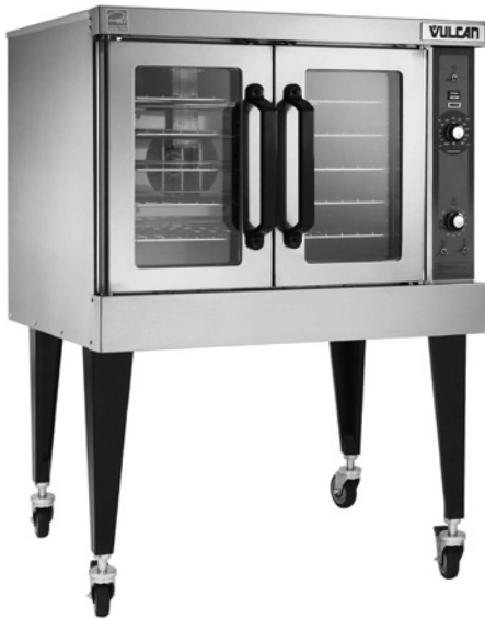
Model VC6GD Shown on optional casters