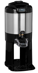
TF SERVER, DSG2 1.5G CD