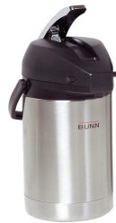
AIRPOT, 2.5L SST LA 6/ CASE