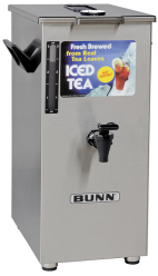
TD4T, BREW THRU LID NUDGER HDL