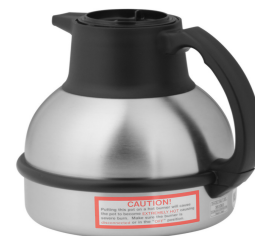
THERMAL CARAFE, ORN 1.9L 12PK