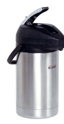
AIRPOT, 3.0L SST LA SINGLE PK