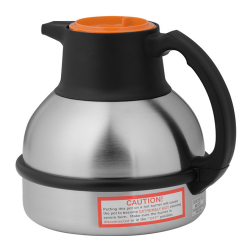
THERMAL CARAFE, ORN 1.9L 1PK