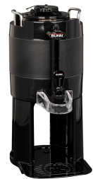
TF SERVER, 1G/3.8L MECH BLK