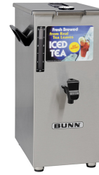
TD4T, W/BREW THRU LID & LIFT HANDLE