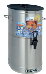
TDO-4, RESERVOIR BREW THRU