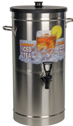
TDS-3.5, 3.5 GAL