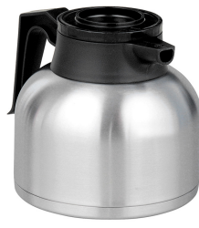
CARAFE, SST 1.9L SHRT BLK 12/