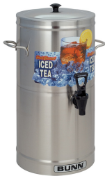
TDS-3, 3 GAL