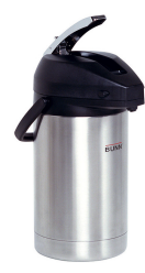
AIRPOT, 3.0L SST LA 6/ CASE