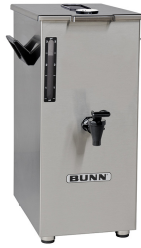
TD4T, BREW THRU LID NO DECAL NUDGER HDL