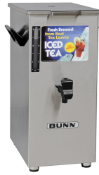
TD4T, W/ LIFT HANDLE