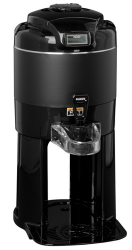
TF SERVER, DSG2 1G/3.8L BLK