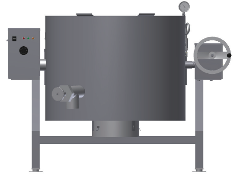
Model ALTGB-F Shown with optional draw-off valve

* Call AccuTemp for additional information