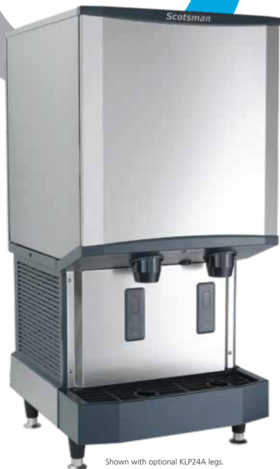
Shown with optional KLP24A legs.