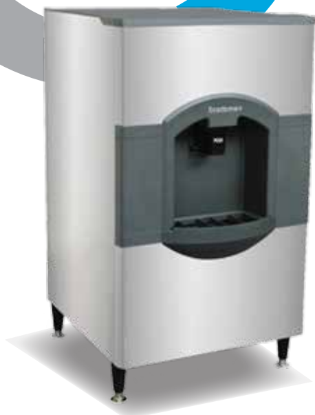
Easy Push Chute