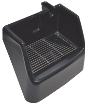
TRAY ASSY, EXTENDED DRIP Product #: 44015.1000