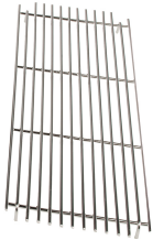
WIRE GRILL,DRIP TRAY (SINGLE) Product #: 26801.0000